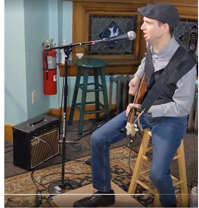
Amp In Front